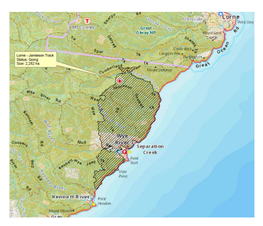
Fig 2: Map of Lorne-Jamieson Track Fire Extent: 30 December 2015

Relief Centres were established at the Apollo Bay Leisure Centre and at the Surf Coast Shire Offices in Torquay, providing relief and respite support to people evacuated or impacted. Fire affected areas remained closed over the New Year's weekend. The Great Ocean Road was reopened to the public on 6 January 2016. On 21 January 2016, 34 days after ignition, the 2,500 hectare fire was listed as contained.