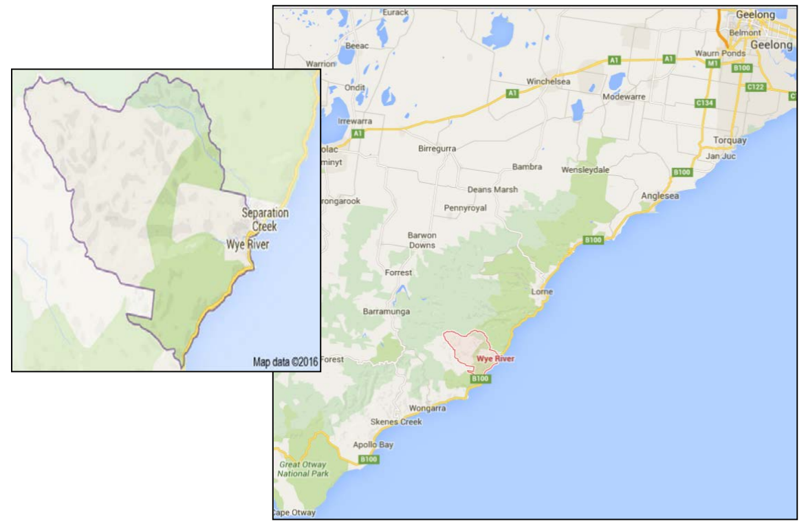
Fig 1: Map of Wye River and Separation Creek and surrounding region