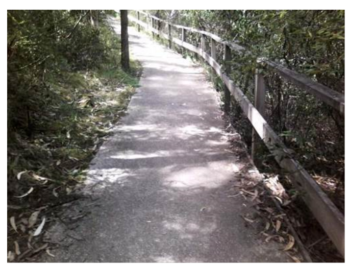
Harrington Park Pathway

Reinstatement will include repair to the existing concrete pathway and installation of timber handrails.