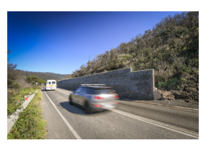
Two lanes are now operating at the base of the Paddy's Path hillside

This work will cover an area beginning immediately below two Iluka Avenue properties and extend to the bottom of the hillside.