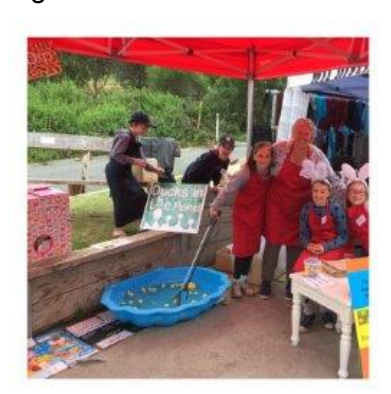
Last photo of CFA Easter Fete festivities

Experienced personnel are now monitoring hillsides and road edges for any change. We will undertake more highly specialist geotechnical investigations and monitoring following any significant rainfall.