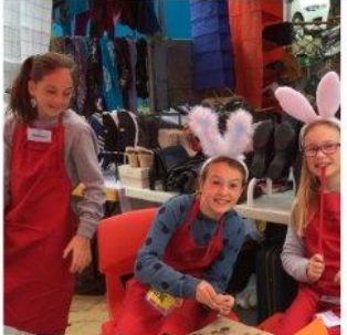
CFA Easter Fete activities