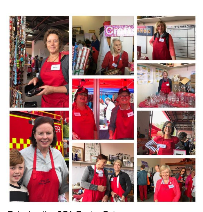
Enjoying the CFA Easter Fete

This needs to be done so we can finalise design drawings prior to commencement of construction. Approximately 21 walls will be rebuilt, and construction is likely to commence early June.