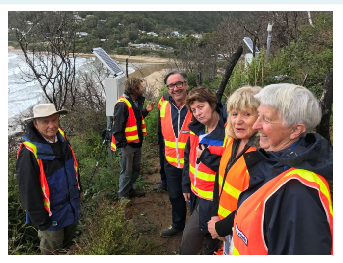
Community members inspect vegetation on the Paddy's Path hillside