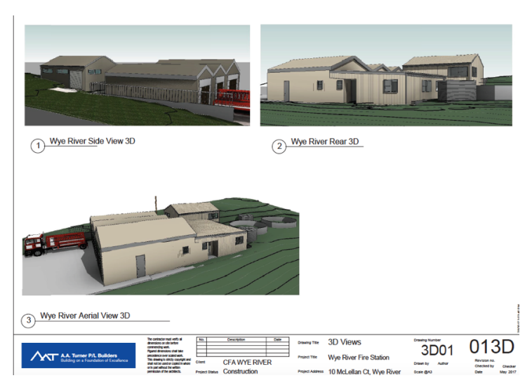
Isometric elevations of the new Wye River CFA building

"We intend to use as many locals as we can for this development," said Alan.