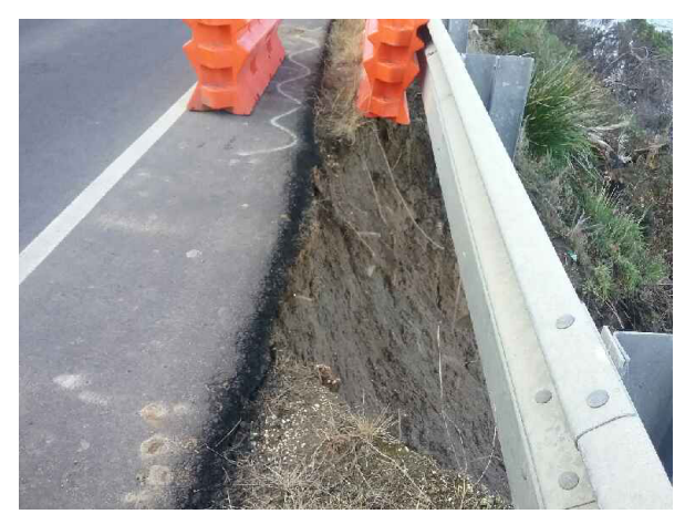
The landslip, on the ocean side of the road about six kilometres west of Wye River

Mr Koliba said the retaining wall would be about 30 metres long and up to five metres high. The affected area of road has been closed with concrete barriers. VicRoads continues to monitor a priority list of sites along the Great Ocean Road as it progresses its stabilisation works.