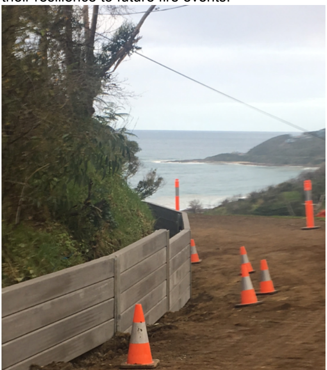
A new retaining wall in Mitchell Grove, Separation Creek

The new walls will replace retaining walls located within the Council road reserve that were damaged in the bushfire. Council is using non-combustible materials including steel I-beams and reinforced concrete sleepers for new structures to increase their resilience to future fire events.