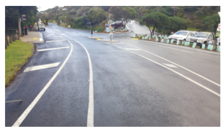
The township improvements at Wye River

"The community asked for these facilities and VicRoads is very pleased to have now delivered significant safety improvements to one of the Great Ocean Road's most popular tourist destinations."