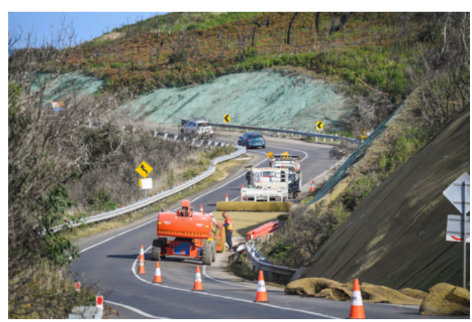
Netting unstable hillsides west of Wye River.

They will next focus on another dozen sites between Apollo Bay and Lorne and 30 sites between Separation Creek and Jamieson Creek.