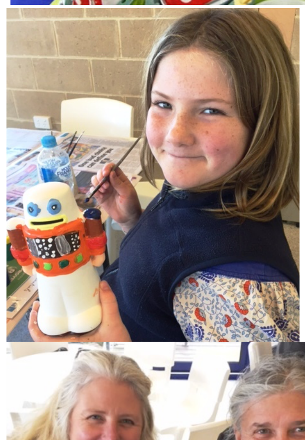
Good times at the winter community lunch