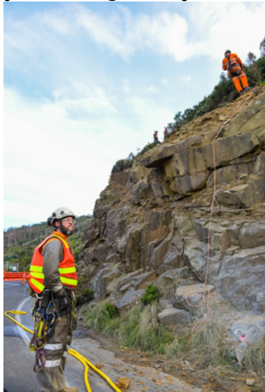
Stabilising the cliff face just west of Lorne in preparation for installing rock fall netting.

VicRoads appreciates feedback and comments from the community. Please have your say at greatoceanroad@roads.vic.gov.au