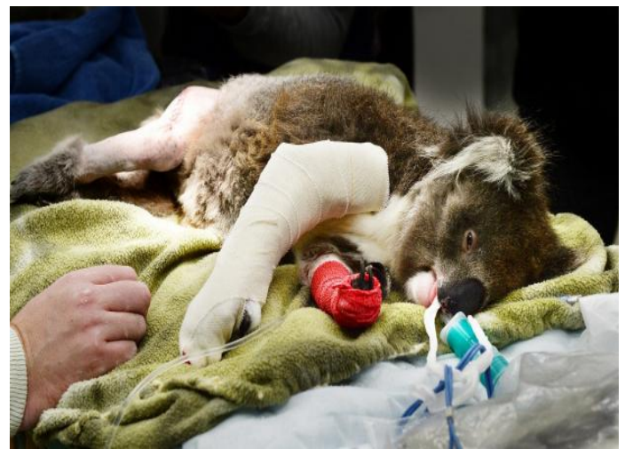
Protect our wildlife- dog attacks on our local koalas happen too often in our townships. Domestic animals must be under owner control at all times.

We have been very concerned about reports of dog attacks on koalas. So few koalas survived the fire we can't afford to lose any. Please ensure that any dogs on, or visiting your property are not allowed to wander. We have asked COS to give this attention.