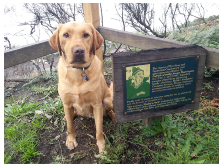
Paddy - a well behaved, non-wandering Wye River resident dog!

Council's Rangers will be patrolling the area and will take appropriate action if dogs are found wandering. If people see dogs wandering then contact Council's Compliance Unit and we will try to respond as soon as possible. The best number to call and report a wandering dog is 5232 9400.