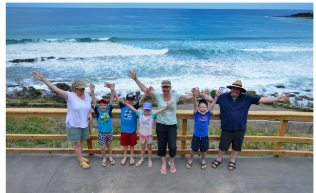
Holidaymakers enjoy the temporary reopening of Paddy's Path during the summer holidays.

Now soil-nailing works have resumed along the Great Ocean Road at Wye River, Paddy's Path has been closed to pedestrians Monday to Friday.