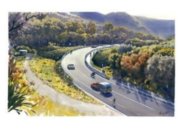
An artist's impression of the new Grey River Bridge

The bridge will be replaced with a new single-span structure. About 130m of the Great Ocean Road will be realigned both sides of the bridge approach. The project is due to be completed in May 2018. The new bridge is being constructed on the ocean side of the old bridge. This will mean two lanes of the Great Ocean Road will remain open for all traffic for much of the construction phase.