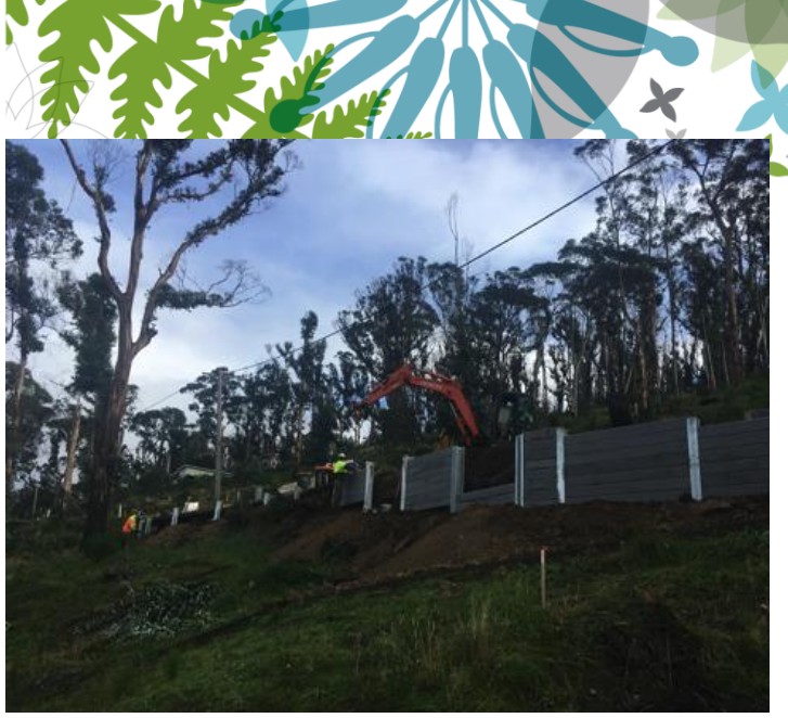
New retaining walls being constructed