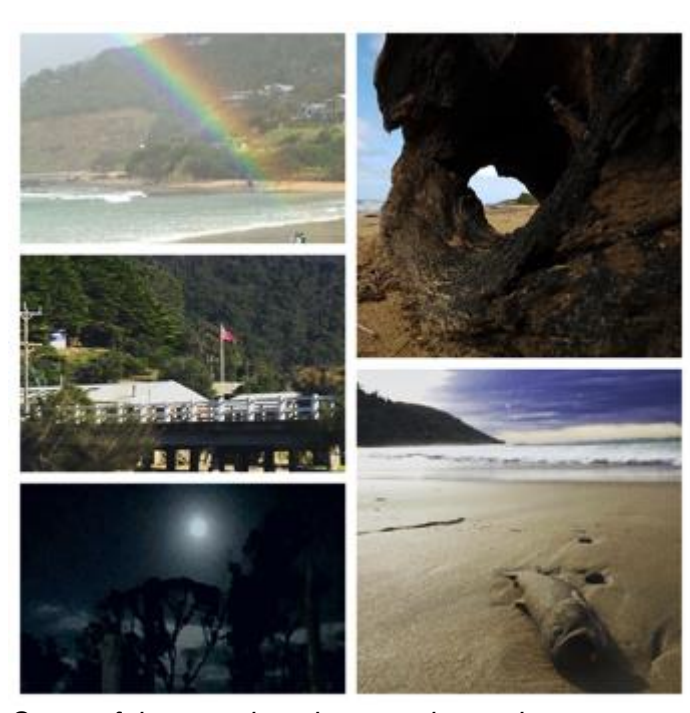
Some of the amazing photo entries to date

No entry fee and open to all ages - so get involved, post as many photos as you want, spread the word why you love Wye.