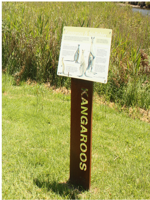
Figure 1 Existing Riverwalk Signage to be retained