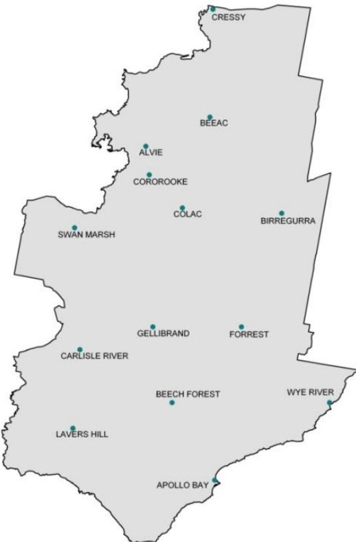
Colac Otway Shire has been an unsubdivided municipality (no Wards) since March 2007.

Colac Otway has many advantages which could turn these challenges to opportunities. These include the duplication of the Princes Highway, which will create a dual carriageway between Geelong and Colac, and the attractiveness of the natural environment as a place to live and visit, generating economic opportunities. Additionally, the Shire is well serviced with social infrastructure such as health services, schools and recreational facilities; and it has affordable housing and land available for further development. These advantages can be built on with strategic action by Council in partnership with others, providing a context in which the Shire has the potential to grow and prosper.