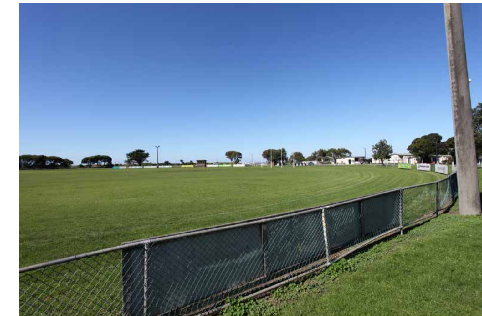
Existing sports oval at the Recreation Reserve.