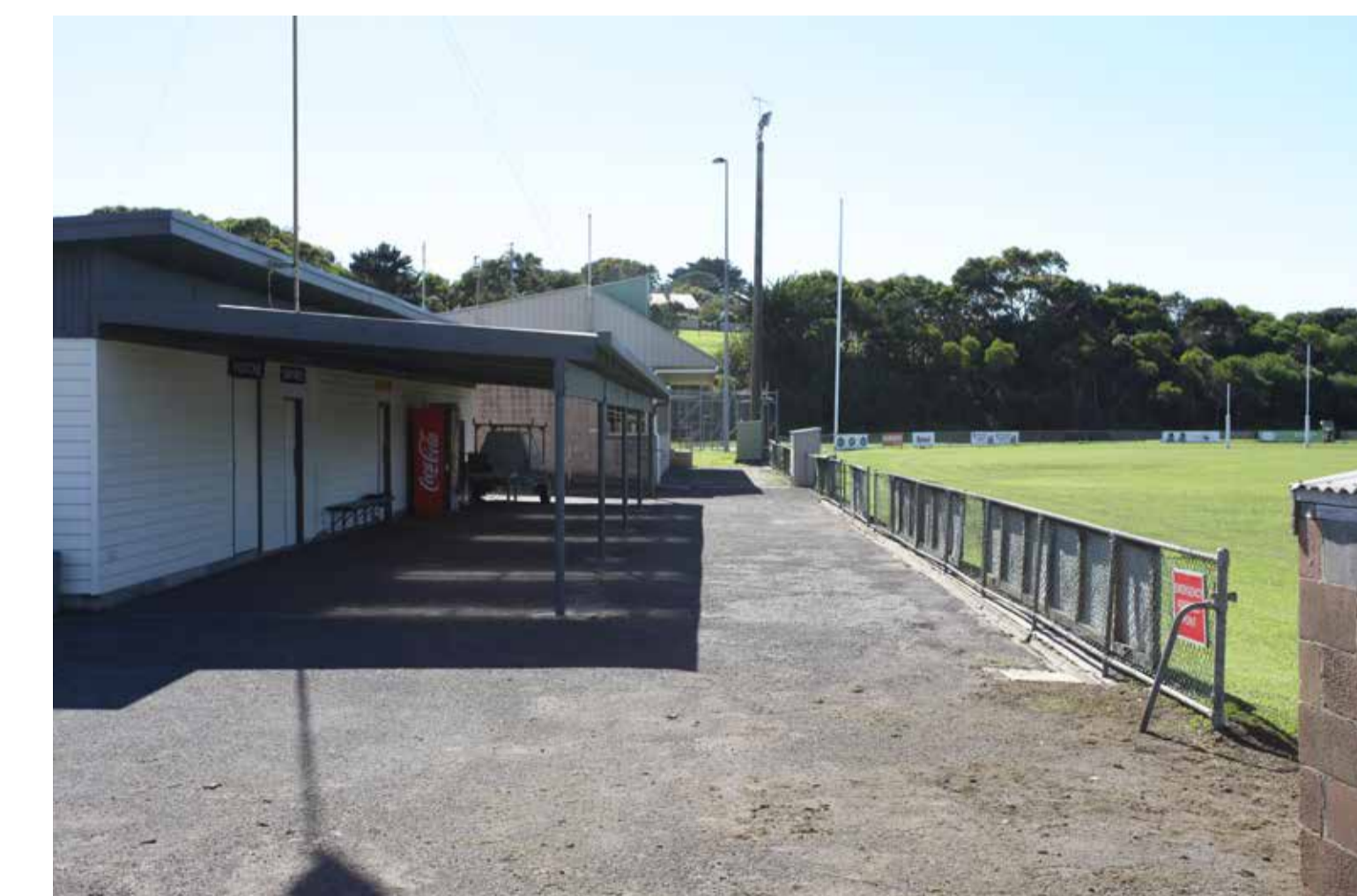
Existing cricket / football pavilion.