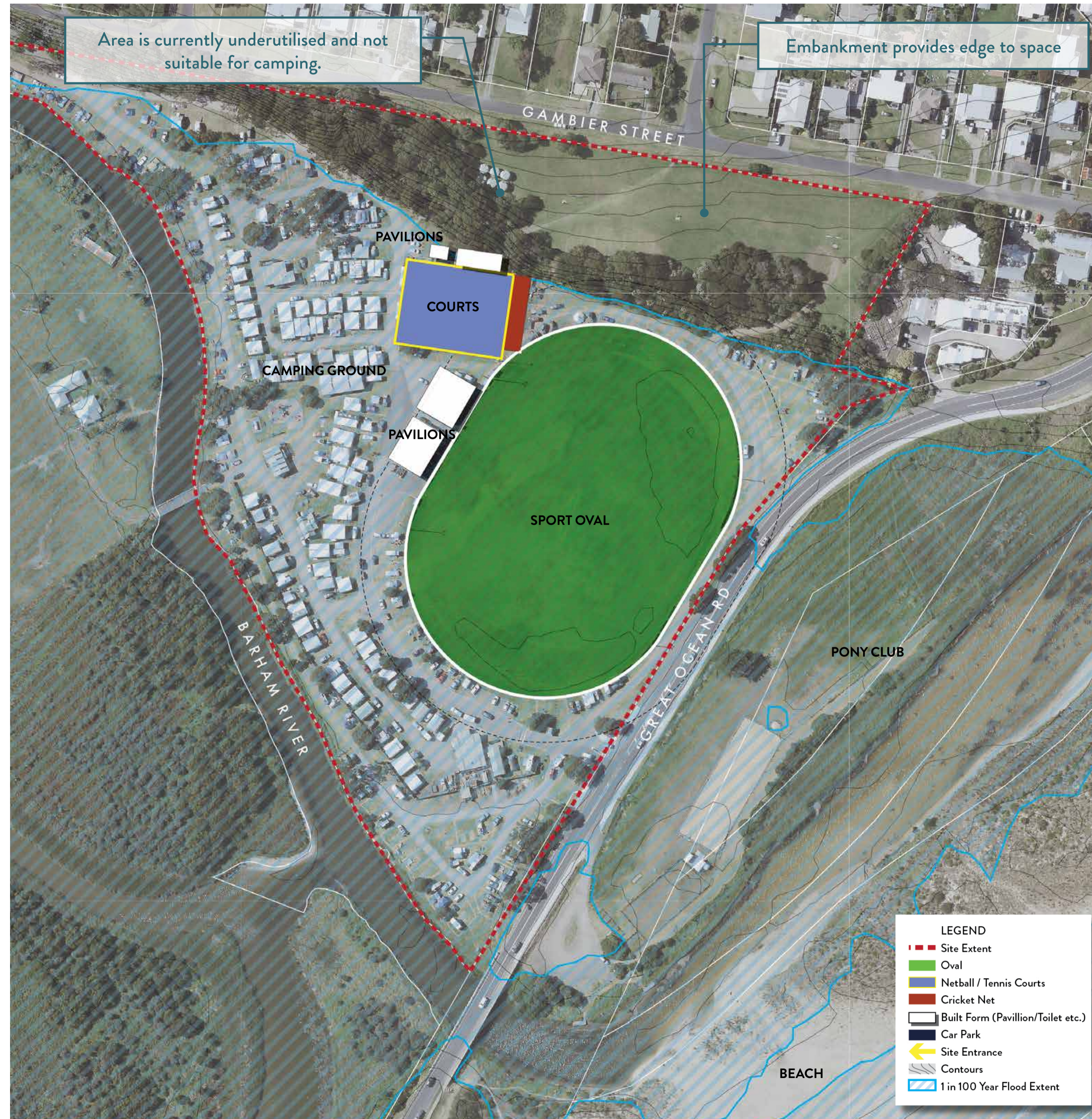
Recreation Reserve - Existing Conditions