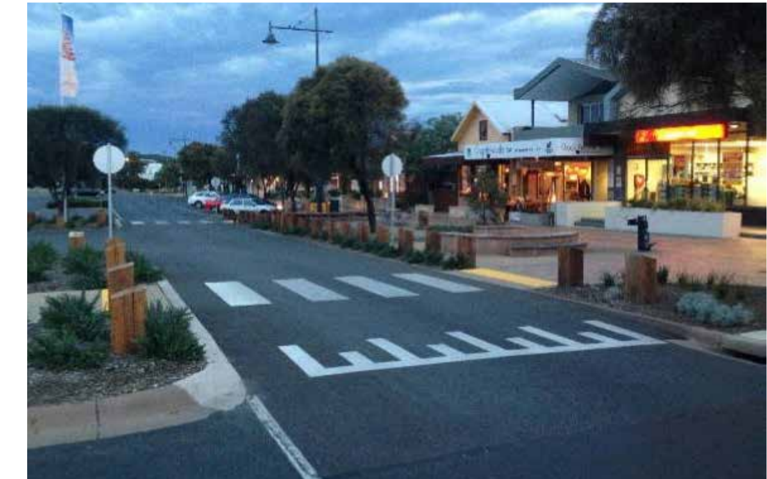
Raised pedestrian crossing

The following images are examples of pedestrian crossing treatments.