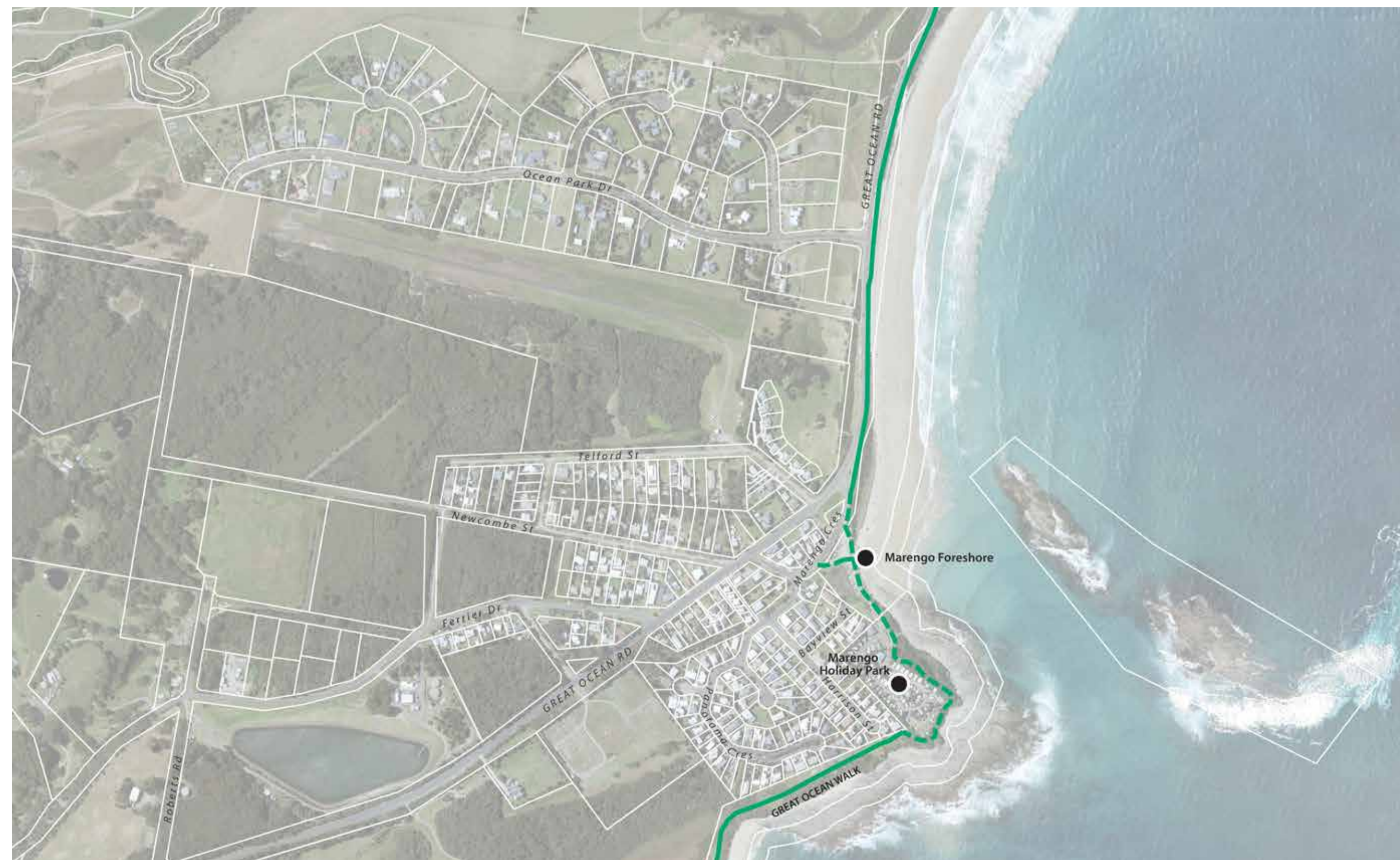
Township Connections - Marengo