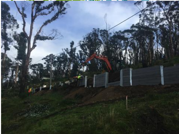
New retaining walls being constructed