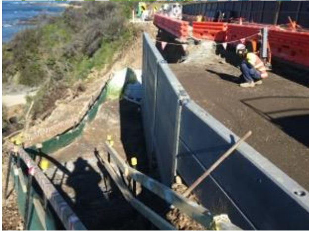
The Great Ocean Road retaining wall taking shape 6km west of Wye River