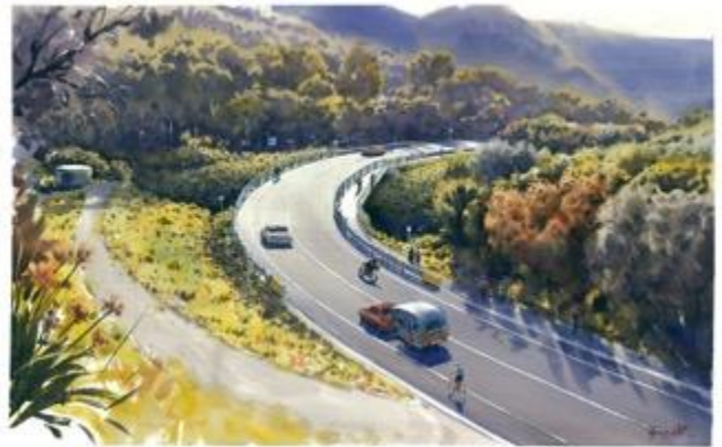
An artist's impression of the new Grey River Bridge

The new bridge is being constructed on the ocean side of the old bridge. This will mean two lanes of the Great Ocean Road will remain open for all traffic for much of the construction phase.