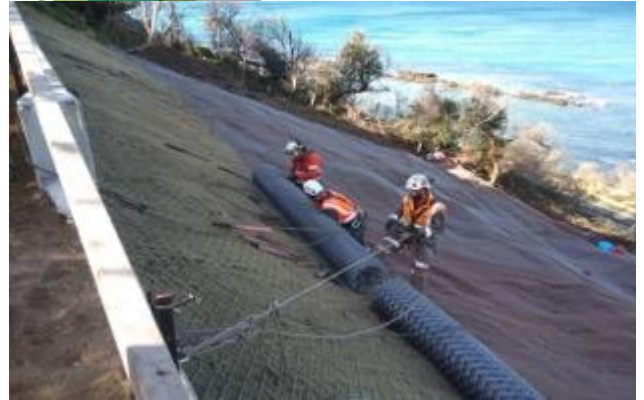
Workmen laying steel mesh on the Paddy's Path hillside at Wye River

The pathway in this vicinity has been restored with concrete laid to both approaches of a pedestrian bridge that is due to be erected at the end of August.