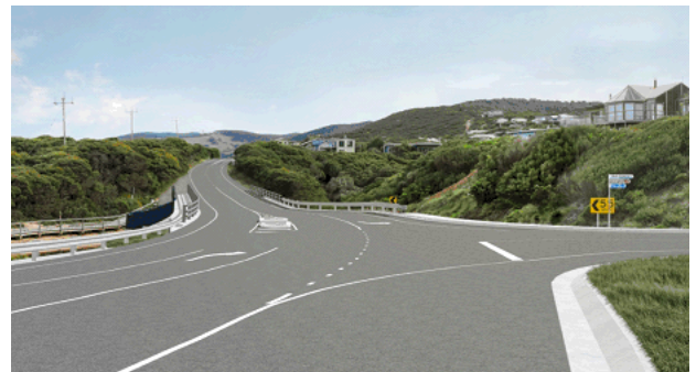
An artist's impression of approaches to a new Moggs Creek Bridge

In September, about 80 local residents attended an information session in Fairhaven to view and discuss concept plans. We are consulting with a range of local community groups, businesses, councils and road users to identify the interests and needs for the replacement bridge. For more information, drop us an email.