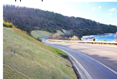
Stabilised hillsides west of Wye River

As spring presents more favourable weather, road works and further stabilisation projects are being stepped up.