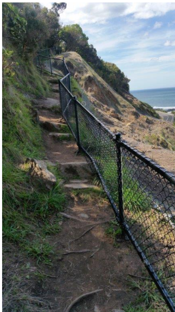
A new safety fence on Tramway Track, west of Lorne

As part of a rock-fall netting project, geo-technical experts installed about 40 metres of steel hand railing on the path edge at the crest of a hill above the Great Ocean Road.