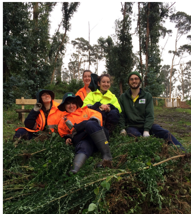
Southern Otway Landcare Network's skilled Green Army team

Local flora species recorded included; Hazel Pomaderris, Forest Clematis, Snowy and Musk Daisy, Prickly Moses, Blue Gum, Blackwood, Prickly Currant Bush, Manna Gum, Native Tussock Grasses, Dogwood, Hemp Bush and Bidgee Widgee. Bird species included: Crimson Rosella,