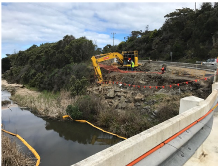
Boring piles for the new Grey River Bridge

One lane of the Great Ocean Road is temporarily closed for earth works on the approaches to the new bridge. Traffic management is in place.