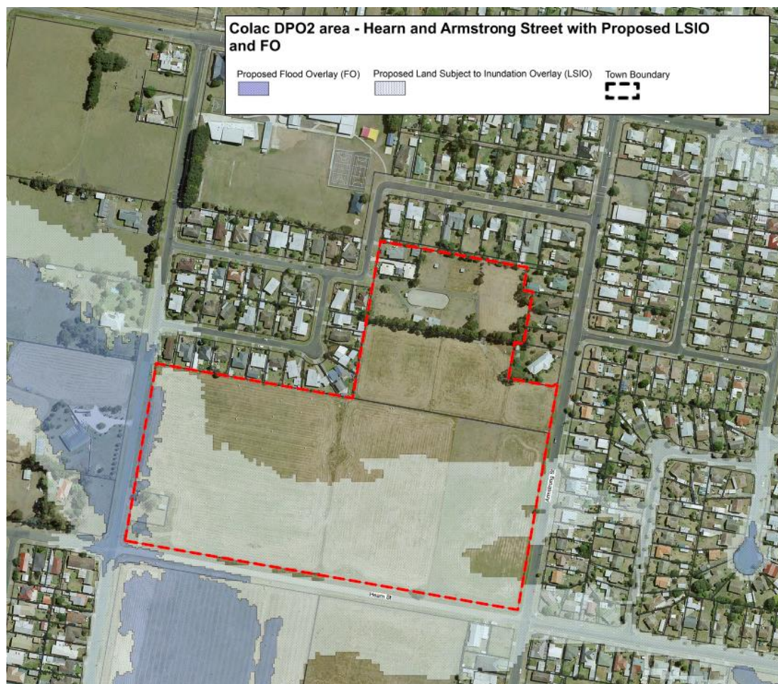
Figure 1: Colac DP02 area

The Shire has facilitated the preparation of a development plan (DP02) to enable development of an area north-east of the Armstrong and Hearn Street intersection. This area is adjacent to land owned by Barwon Water which is used for a sewer pump station and a future sewerage detention storage. The DP02 plans have been sent to Barwon Water for feedback/comment. The land is subject to a proposed LSIO and FO as shown in Figure 1 below.