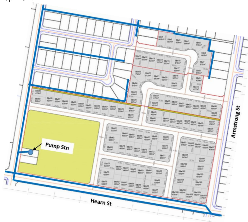
Figure 3: Existing Sewer Layout

The site naturally falls to the south-west and a number of sewers adjoin the area as shown by blue lines in Figure 3 below. All sewers have adequate capacity to service the adjacent proposed development.