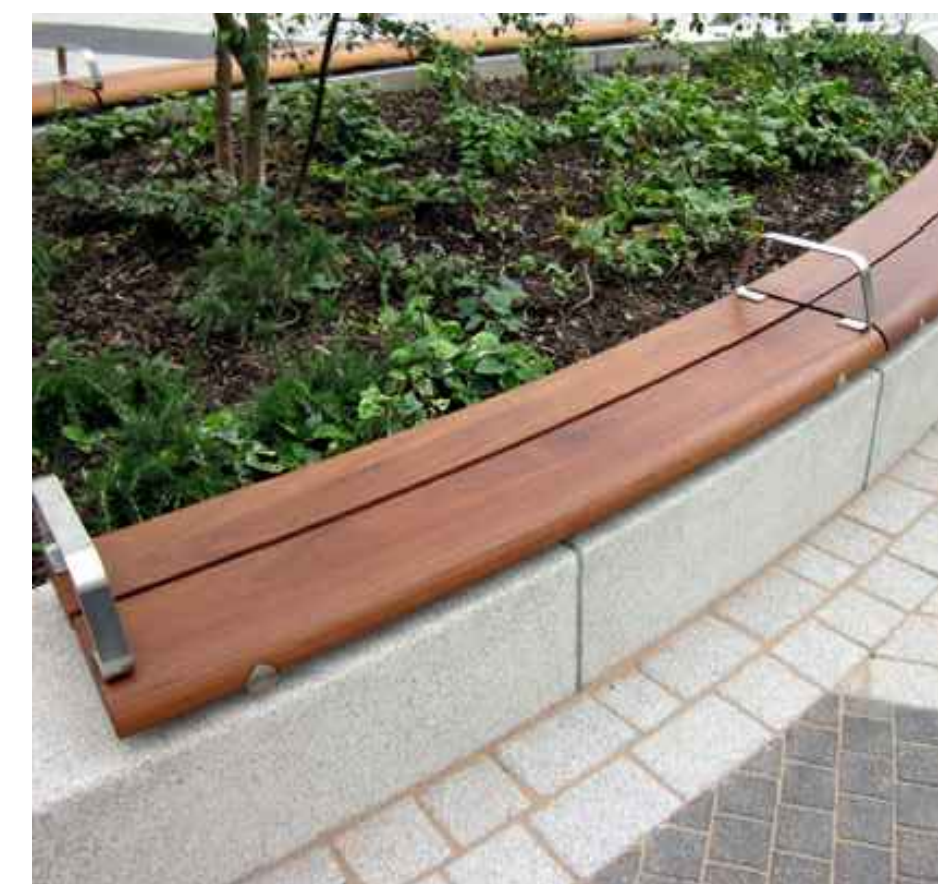
Concrete and timber seat/barrier with planting