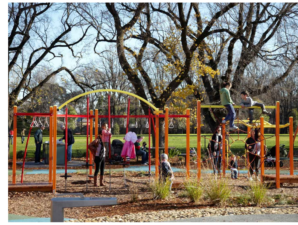
Typical play equipment style