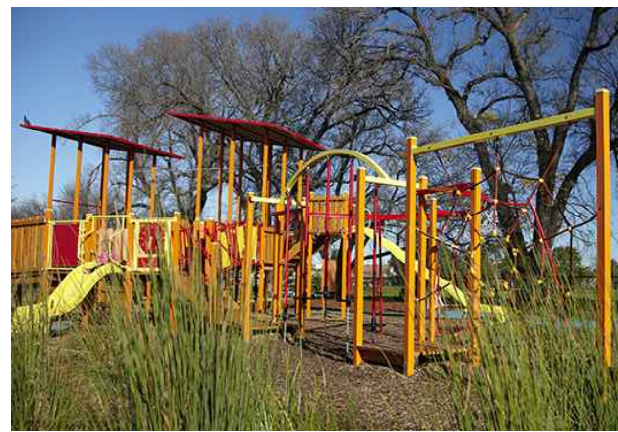
Typical play equipment style