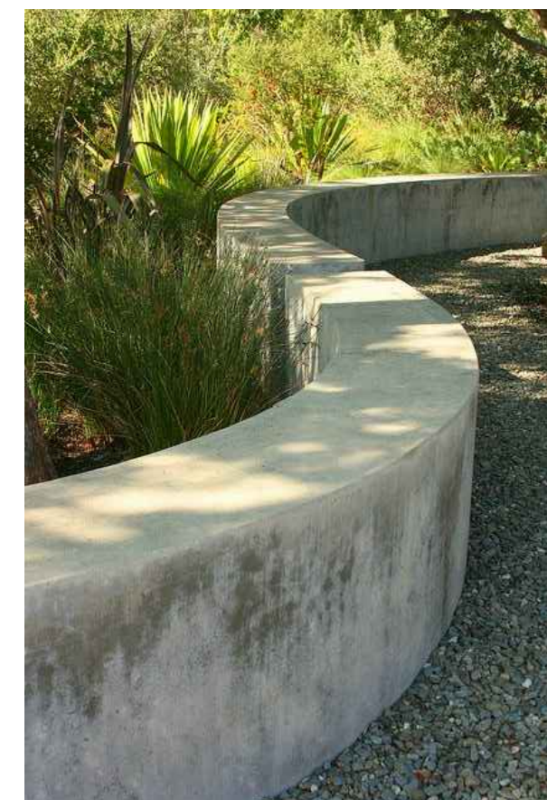
Concrete seat/ barrier