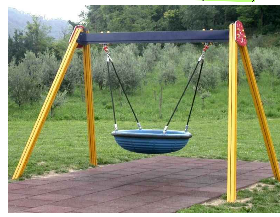
Typical play equipment style