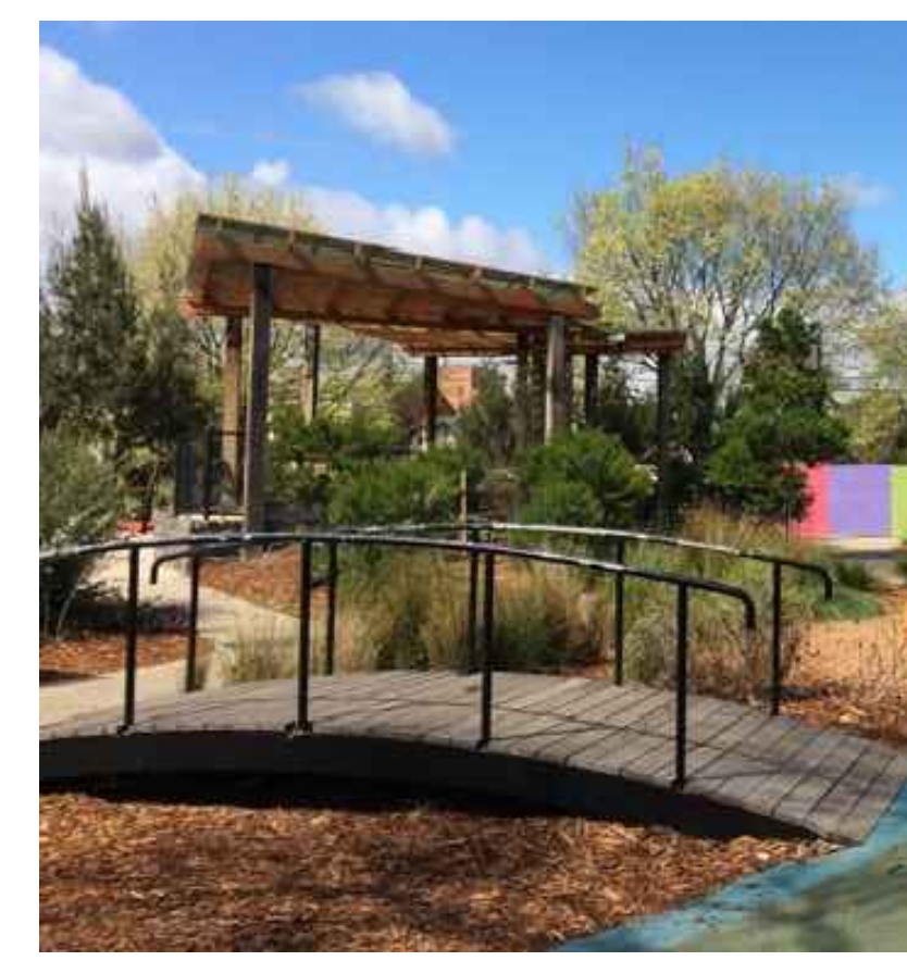
Play bridge to connect playspaces