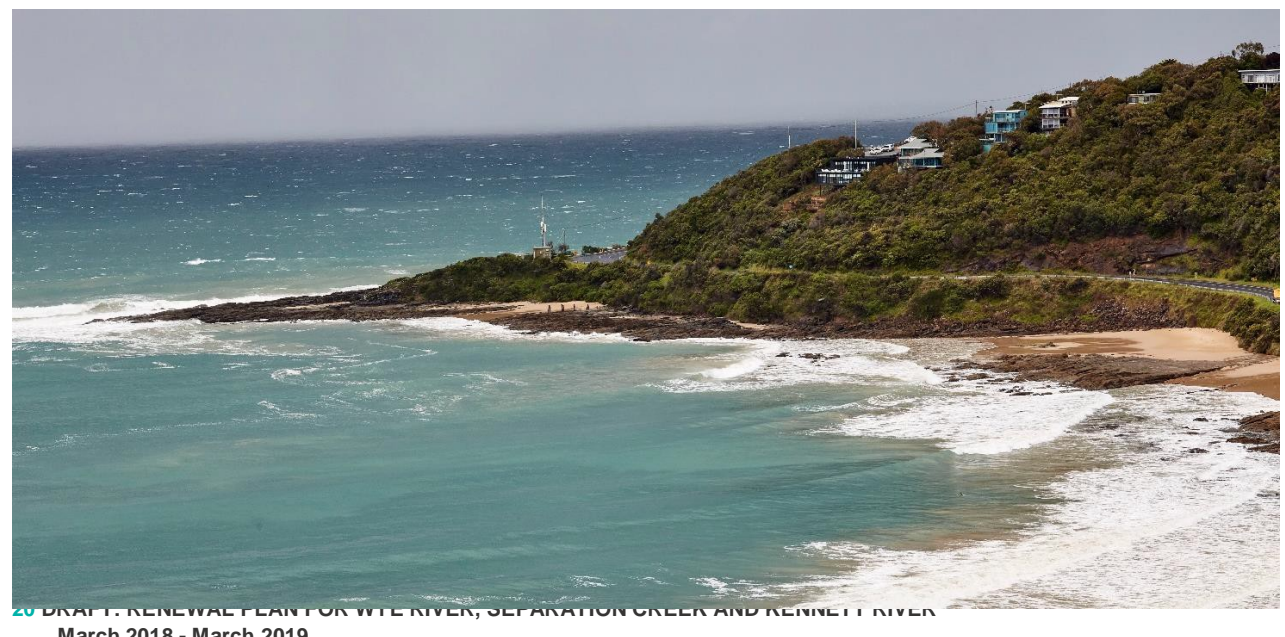
March 2018 - March 2019

All renewal activities included in this document must be delivered in a manner consistent with the community developed and owned statement of values and principles.