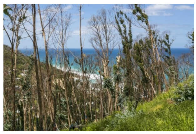
Trees in Wye River