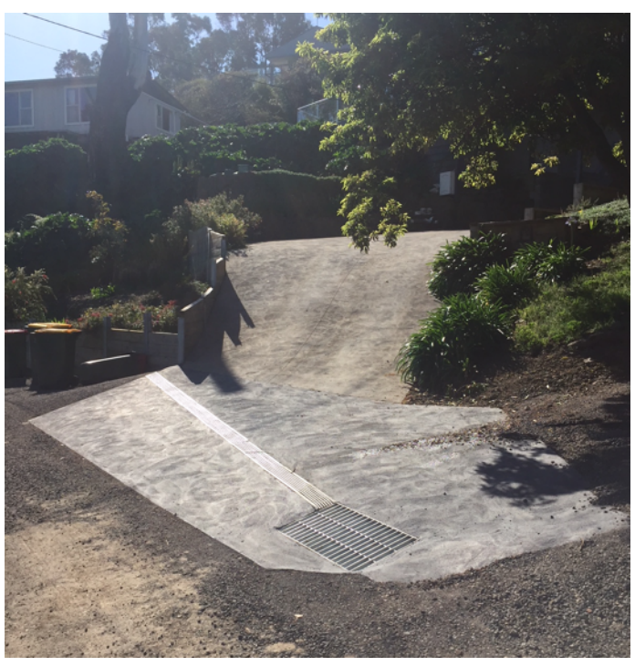
Work is progressing well on driveway culverts across Wye River and Separation Creek