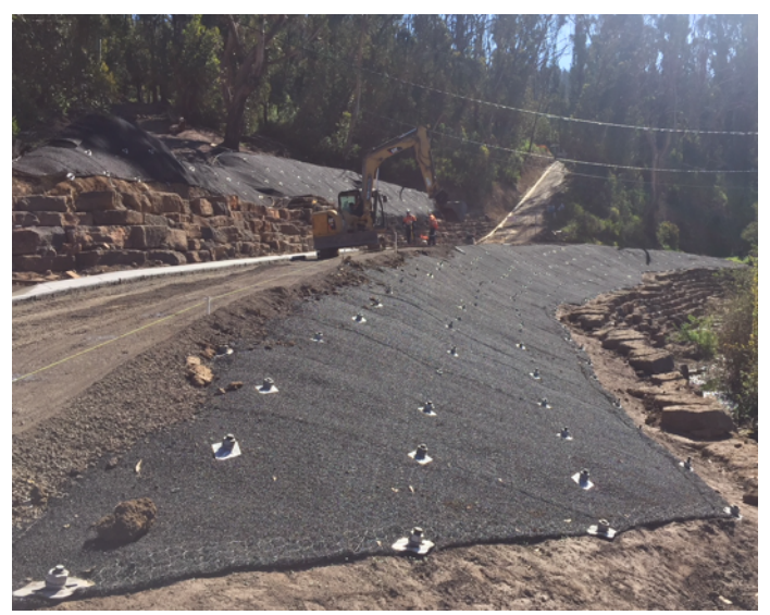
Stanway Drive stabilisation works are nearing completion

One way access from Iluka Extension to Stanway Drive will be available from 15 October.